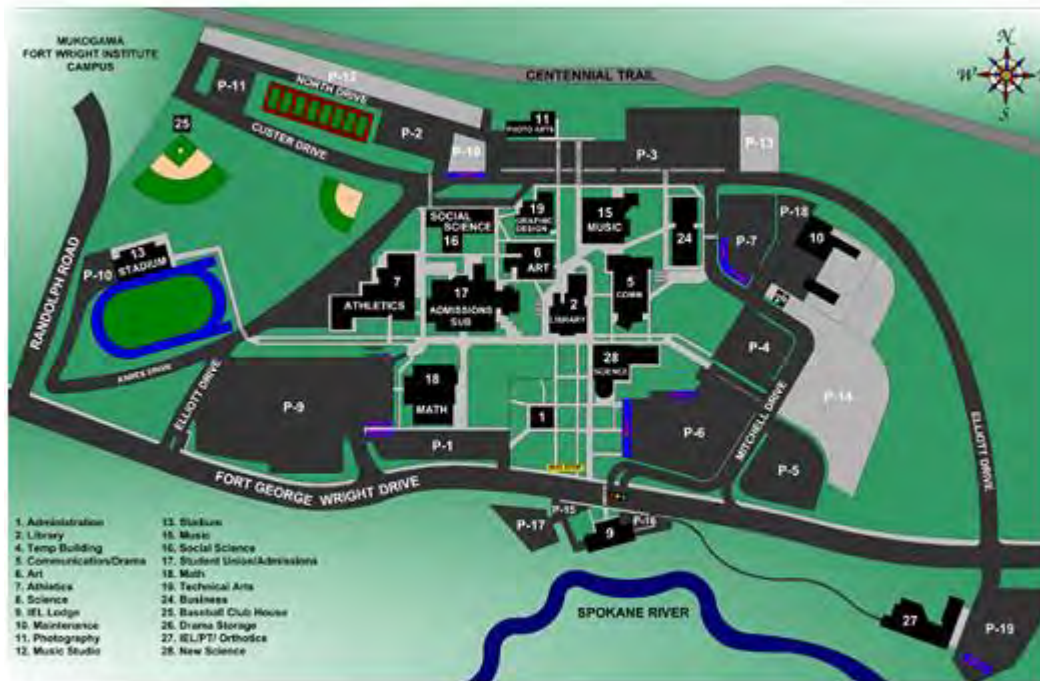
Main Campus (172A)