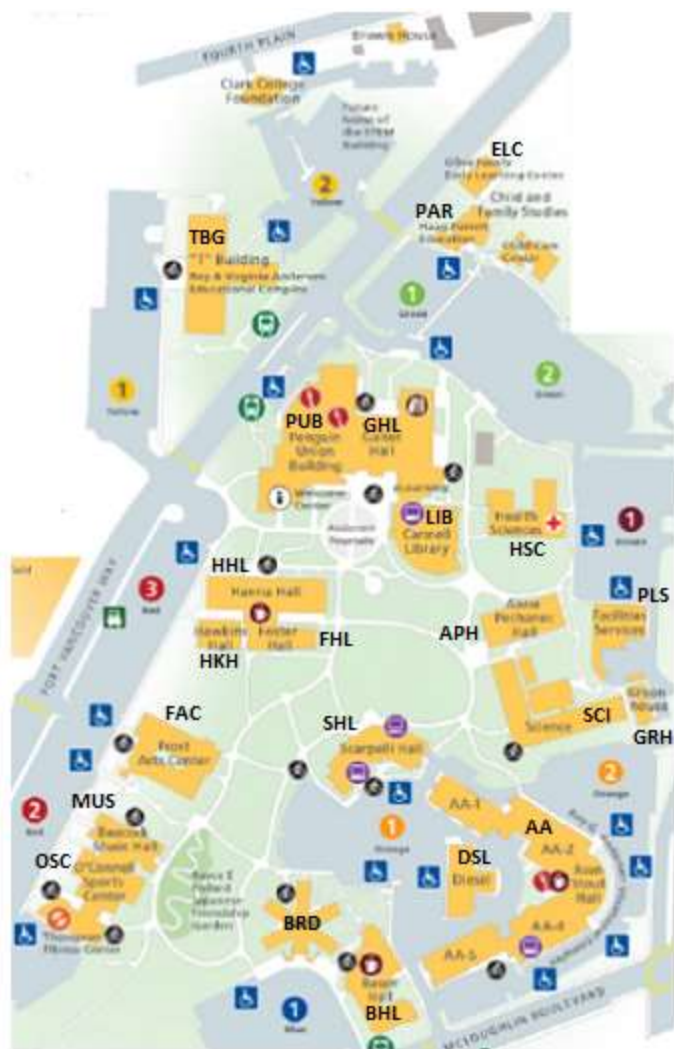
Main Campus (140A)