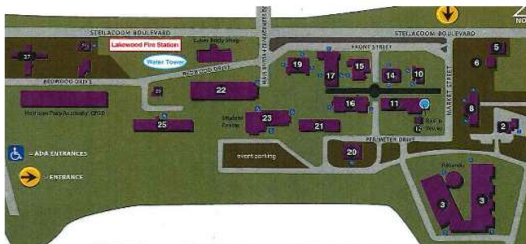
Main Campus (290A)