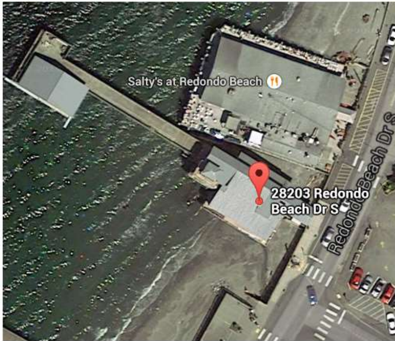
Redondo Pier (090B)